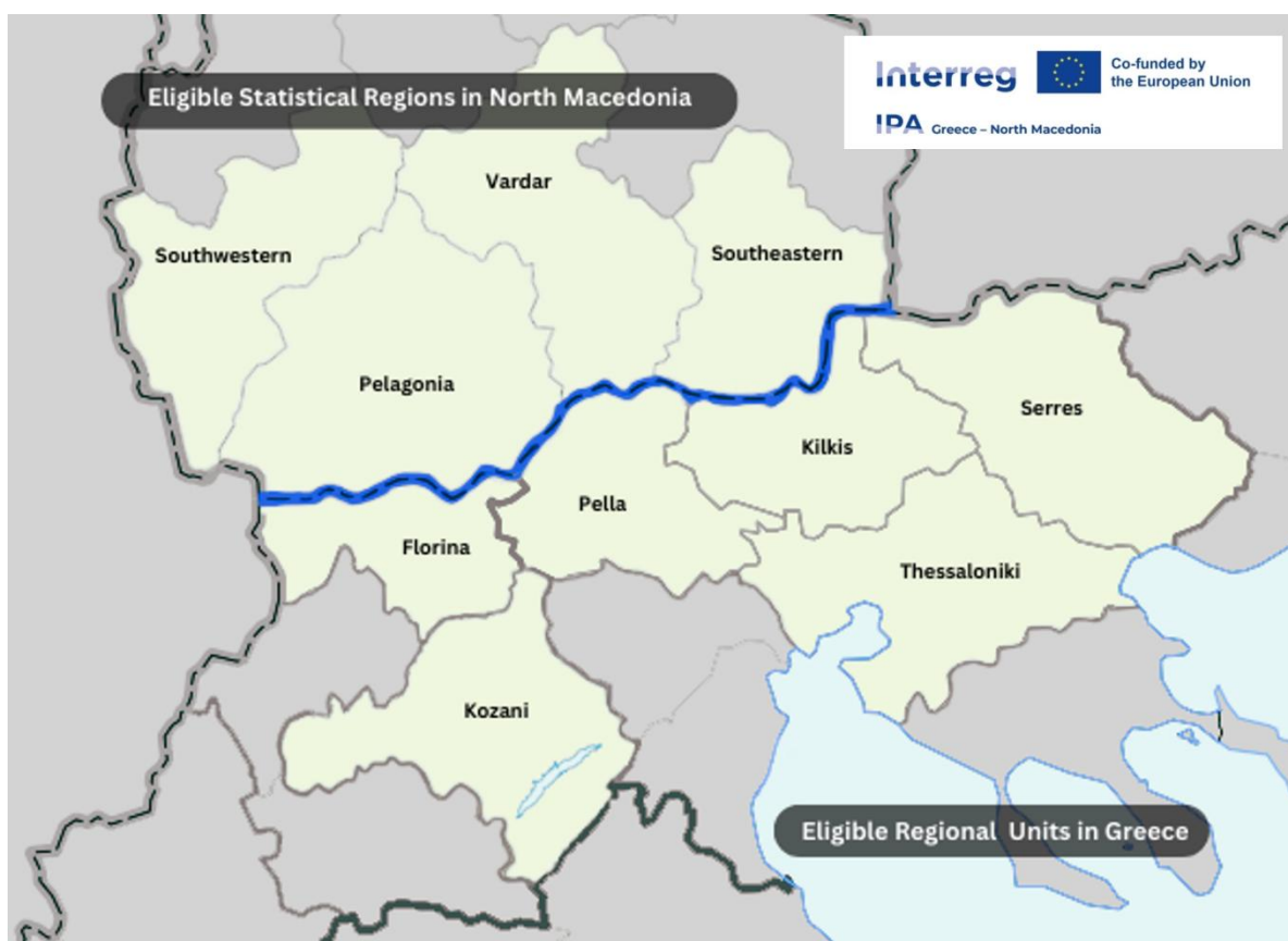
Figure. Map of eligible areas of the Programme

The Interreg VI-A IPA Programme “Greece - North Macedonia 2021 – 2027” is a cross-border cooperation Programme co-financed by the European Union under the Instrument for Pre-Accession Assistance (IPA III). This joint Programme empowers public authorities, private non-profit organizations and other institutions to work together on common challenges and problems, seeking for smarter solutions in the areas of Thessaloniki, Kilkis, Pella, Serres, Florina, Kozani and Vardar, Pelagonia, Southeast and Southwest. The strategy statement of the Programme is “to enhance territorial cohesion by improving living standards and employment opportunities holding respect to the environment and by using the natural resources for tourism” . The total budget of the Programme for the period 2021-2027 is 33.3 million €.